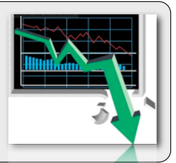
Human Factors Industry News 8

When it comes to safety, there are few success stories as glowing as that of the